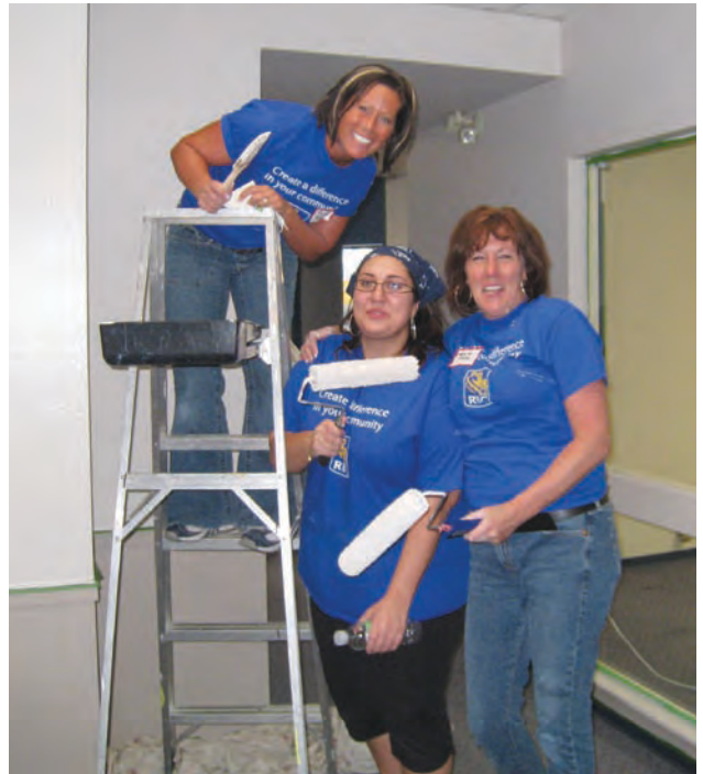
"RBC believes strongly in supporting United Way nationally through our employee giving campaign. Day of Caring is a way of allowing our employees the opportunity to give back on a more personal level and experience the actual needs within our community firsthand."

On April 3rd, 2009 close to 30 volunteers from various organizations joined together to complete projects at 9 different non-profit organizations in Kelowna and West Kelowna. Employees who typically work in banking, insurance, retail and manufacturing instead spent the day working on projects such as gardening, spring clean up, painting, framing and hiking. Thank you to Interior Savings & Okanagan College for their sponsorship and to all the organizations and volunteers who supported this rewarding day in our community.