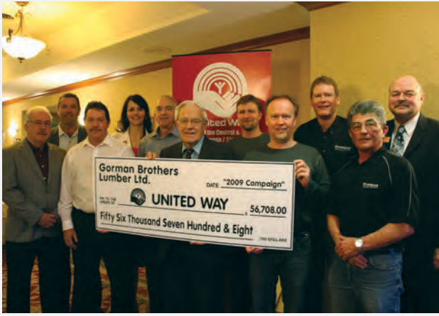
Gorman Bros. Lumber – 2nd largest campaign