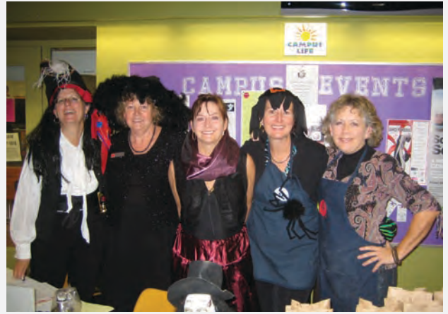
Okanagan College Halloween Barbecue for United Way