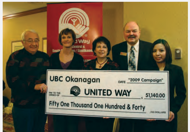
UBCO – 3rd largest campaign